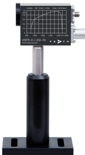
The picture shows the HSPR-X-I-2G-IN-FS with free space input. The photoreceiver will be delivered without post holder and post.