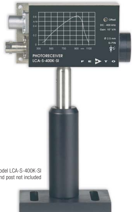
Model LCA-S-400K-SI Post holder and post not included

Threaded M4 and 8-32 holes for mounting on standard posts. 25 mm \varnothing flange compatible with microbench systems. Offset adjustable by trimpot. Fiber optic input and AC-coupling optional. Output short-circuit protected. Power supply via 3-pin LEMO, a mating connector is provided with the device. Optional power supply model PS-15 available. For further information please view the datasheet at www.femto.de .