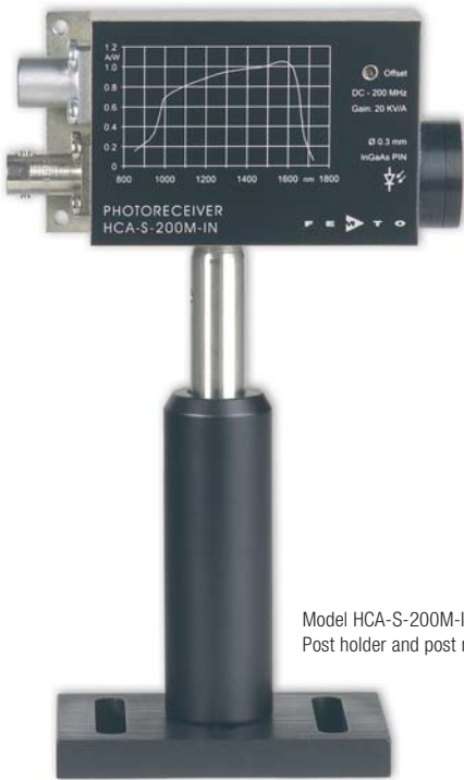
Model HCA-S-200M-IN Post holder and post not included