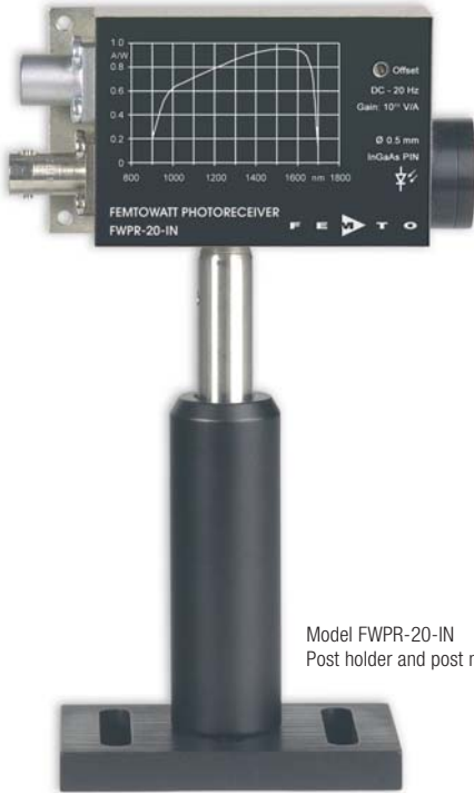
Model FWPR-20-IN Post holder and post not included