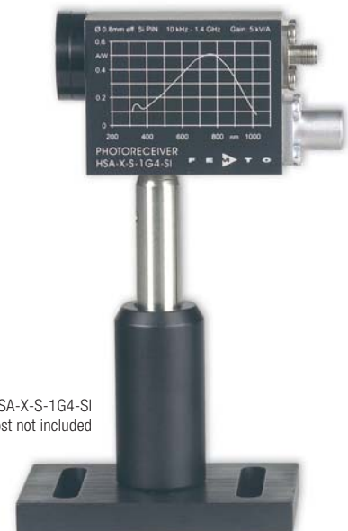
Model HSA-X-S-1G4-SI Post holder and post not included

Threaded M4 and 8-32 holes for mounting on standard posts. 25 mm ø flange compatible with microbench systems. Model with fiber optic input or DC monitor output optionally available. Output short-circuit protected. Power supply via 3-pin LEMO, a mating connector is provided with the device. Optional power supply model PS-15 available. For further information please view the datasheet at www.femto.de .